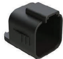
19972-0125 - 6 Way Dust Cover