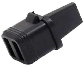
136901002021 - 6 Way Cavity Plug