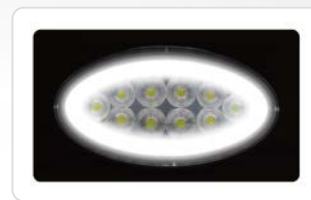
Glo Trac Optical Technology