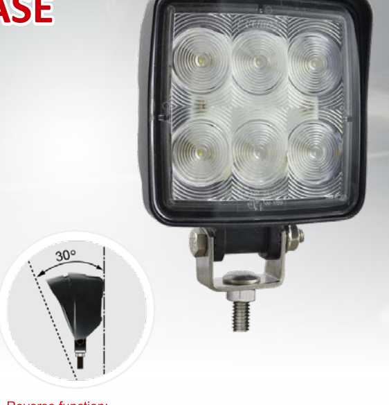
Reverse function: ECE compliance in the declination angle of 30 degrees