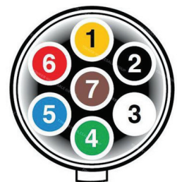
7 Pin Plug