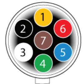
7 Pin Socket